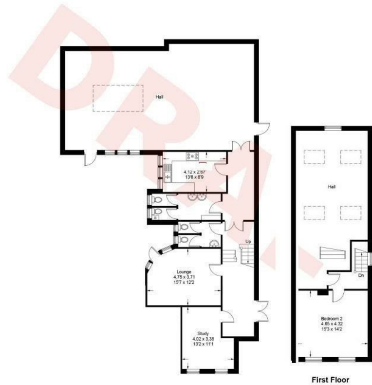
Illustration for identification purposes only, measurements are approximate, not to scale. floorplansUsketch.com © (ID875399)