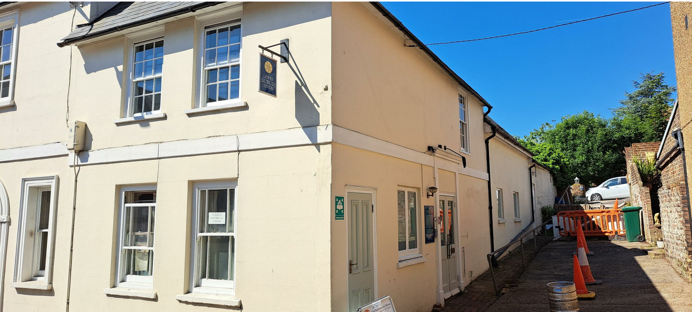
Station Street, Lewes